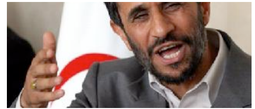
I am so mis-understood?

During his speech in front of the United Nations General Assembly in New York, he said a majority of people in the U.S. and around the world believe the American government staged the attacks, drawing a strong rebuke from President Barack Obama.