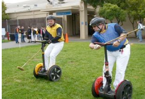
Billionaire Segway Founder Has A Bad Day